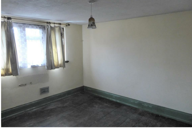
Front aspect window, stripped floorboards.